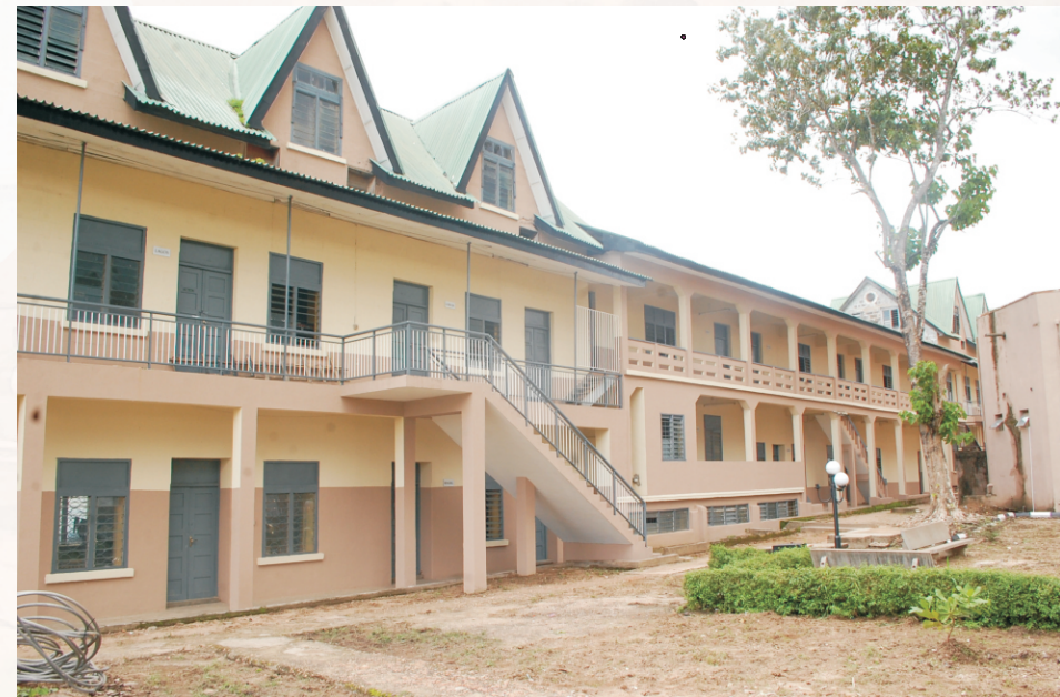
THE MOST REVD. DR. PETER JASPER AKINOLA HALL CROWTHER DEMONSTRATION AND ACADEMY