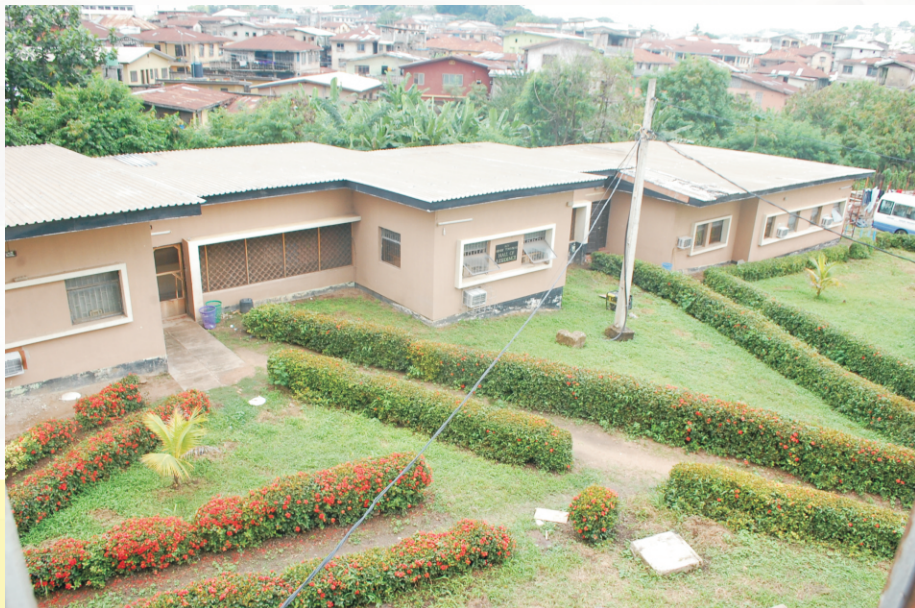
REVD. HENRY TOWNSEND HALL OF RESIDENCE